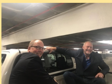
Above: Past-president and President-elect share a Uber – bakkie to save cost

A sub-committee has been formed to address the issues related to 3 rd party sponsorship. We are hoping to have a structure in place for EXCO approval at the next meeting on 2 nd Feb 2019